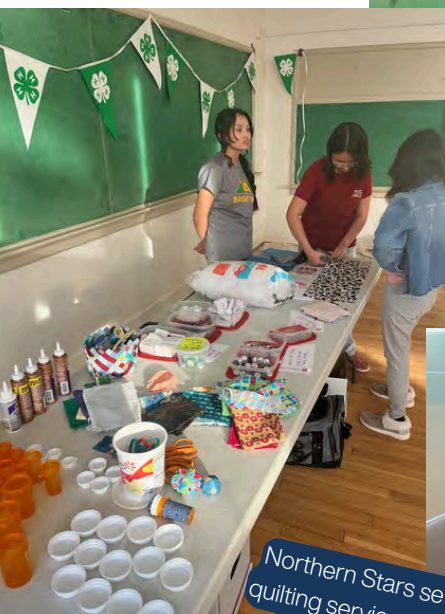
Northern Stars sewing/quilting service project to fire department