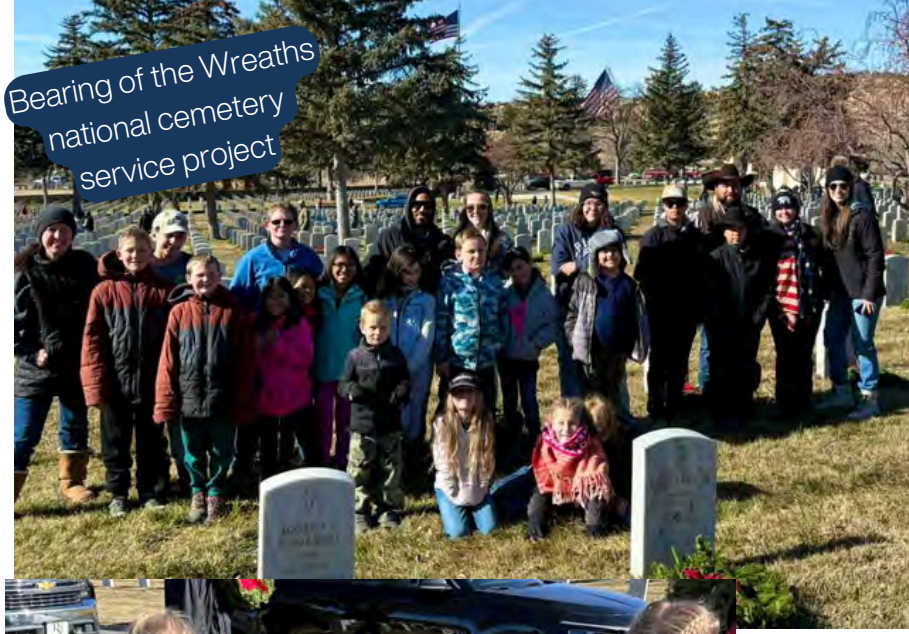
Bearing of the Wreaths national cemetery service project