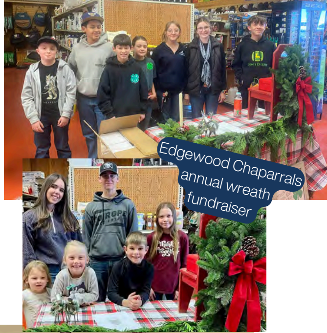
Edgewood Chaparrals annual wreath fundraiser