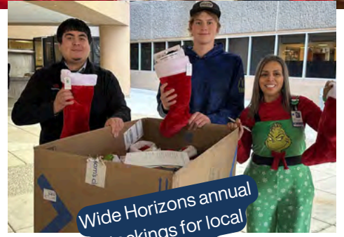
Wide Horizons annual stockings for local hospital