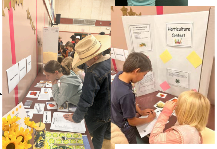
DISTRICT CONTESTS PREP WITH EDGEWOOD CHAPARRALS