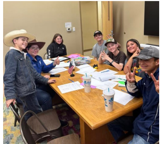
TALKING ABOUT STRESS IN COUNTY COUNCIL