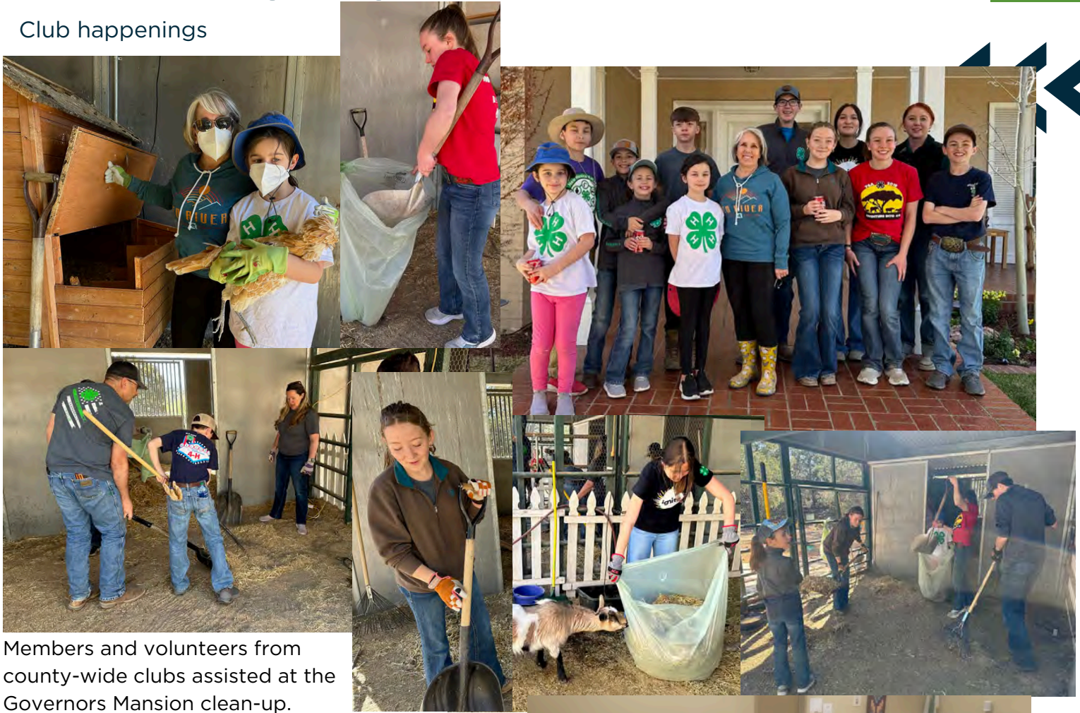
Members and volunteers from county-wide clubs assisted at the Governors Mansion clean-up. Thanks for all your hard work!