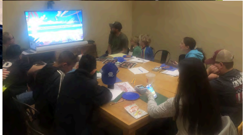
Meats judging teams have been working hard in prep for district and state contests this summer.