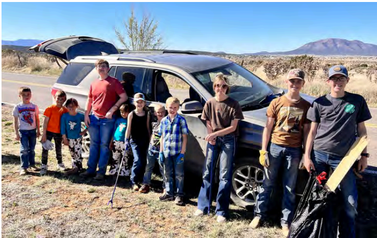
Edgewood Chaparrals with a successful mile clean-up day. Thanks for helping keep our state beautiful!