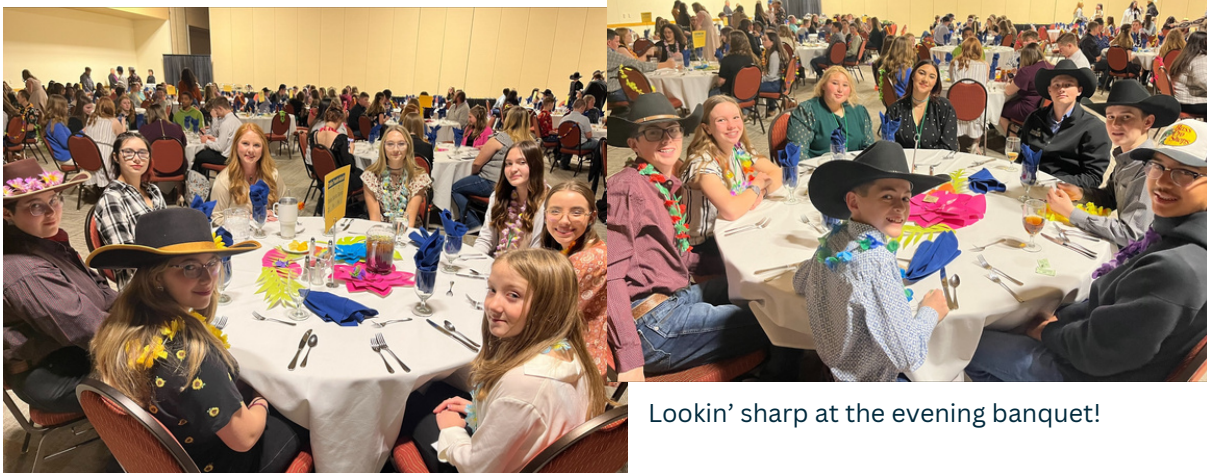
Lookin' sharp at the evening banquet!