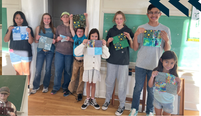
Quilt blocks made by Northern Stars 4-Hers. The final quilts were made by Quilt Corner in Espanola and donated to the fire department for those in need. Great work everyone!