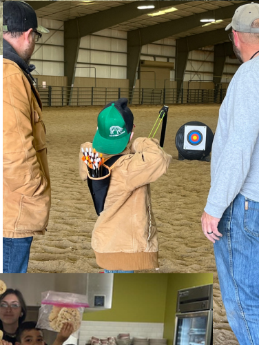
Shootings sports teams are well underway with practices. We're excited for another great year!