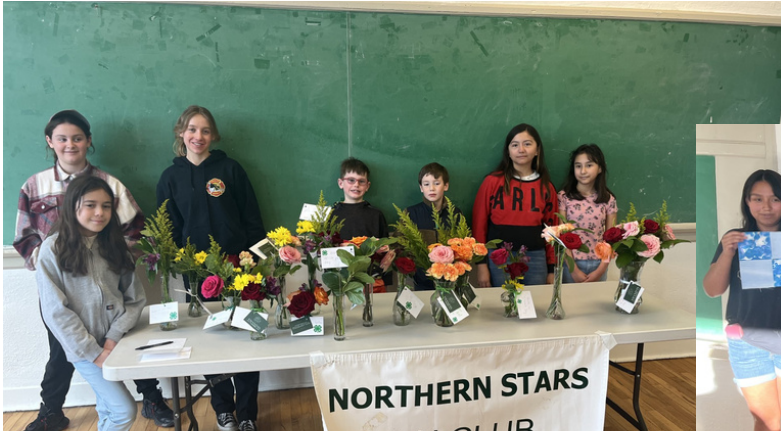
Northern Stars made flower arrangements and donated them to Casa Real nursing home.