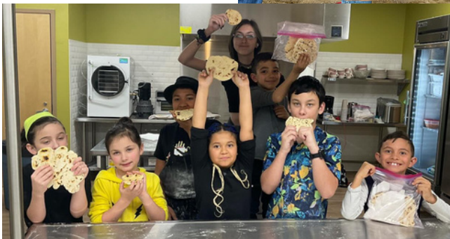
We celebrated New Mexico's birthday with homemade tortillas and hand-woven coasters!