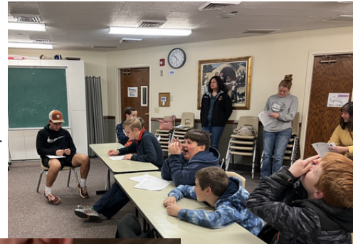
Route 66 Sharp Shooters got creative with some project workshops. They're also "buggin' out" on an entomology project this year.