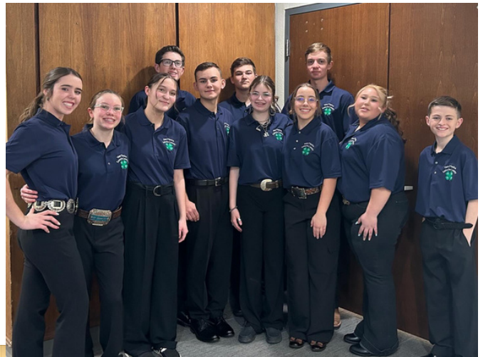
Parliamentary Procedure Team: