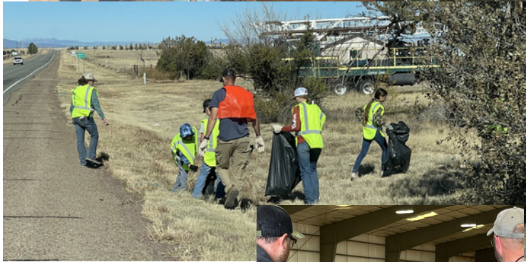
Stanley Spurs Adopt-A-Mile service. Thanks for helping keep NM beautiful!