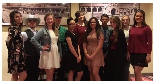
Senior Leadership Retreat 2017

4-H is a community of young people across America who are learning leadership, citizenship and life skills.